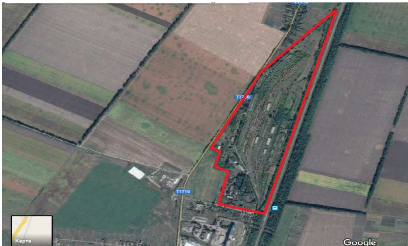
Photo: the territory of the former Baza 32