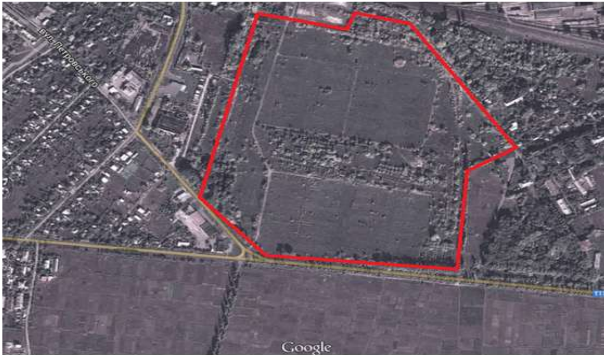
Photo: the territory of the former Kombinat Donetskyy

The Town Council' territories include two more land lots that we offer for industrial enterprises construction.